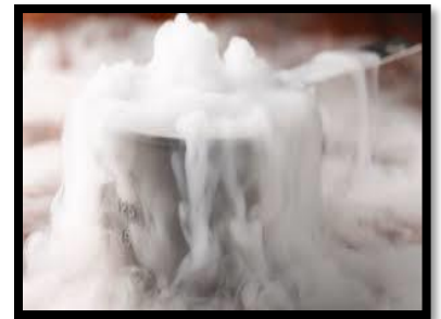
Grinnin Fish Dry Ice